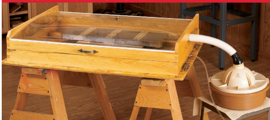
To accelerate the formation of rust, we built this “wet box” and connected it to a cold-air vaporizer. The box’s clear acrylic lid allowed us to observe the progress of the test, while a drain hose allowed excess moisture to trickle away.