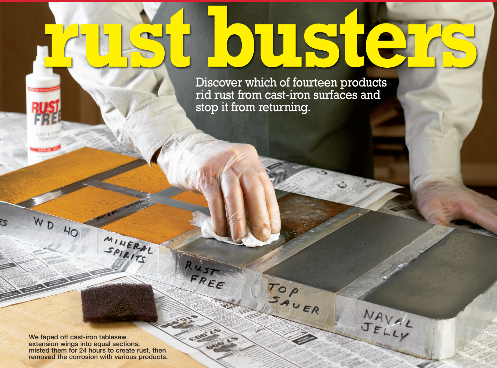
We taped off cast-iron table saw extension wings into equal sections, misted them for 24 hours to create rust, then removed the corrosion with various products.

Discover which of fourteen products rid rust from cast-iron surfaces and stop it from returning.